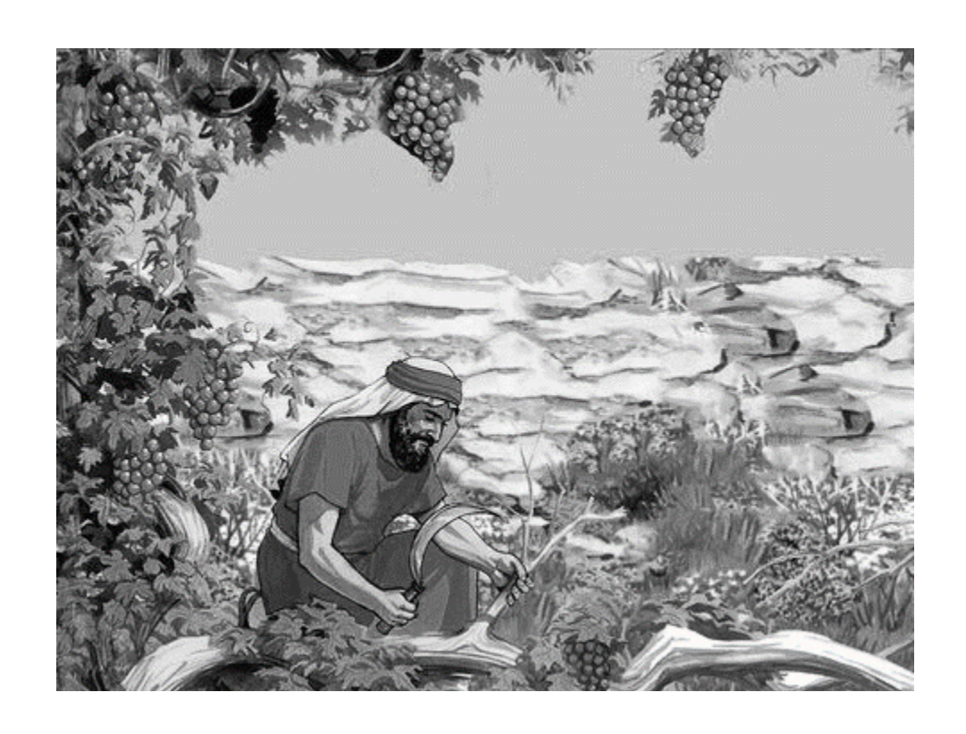
St. Thomas' Episcopal Church Camden, Maine