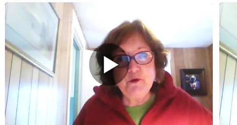
St. Thomas' Episcopal Church