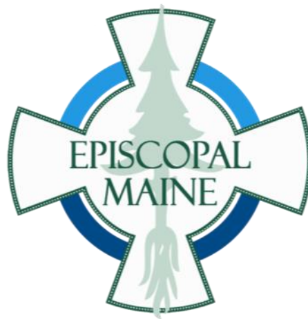
The new seal of the Diocese of Maine.