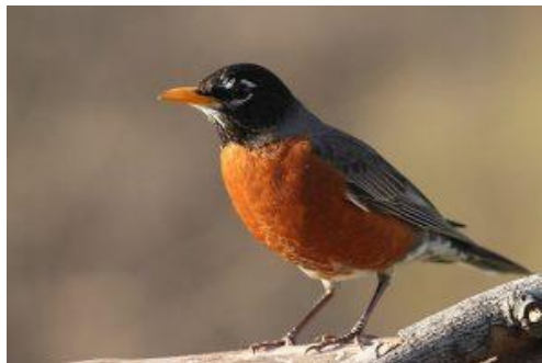
Recently spotted at St. Thomas'!

We sing two more Easter hymns today. Welcome, happy morning! , #179, which has the distinction of being the first Latin hymn (6th century) translated into English for church use. We sing the buoyant music by Arthur S. Sullivan (yes, Gilbert & Sullivan) which he wrote for this text in 1872. We go forth into the world singing At the Lamb's high feast we sing , translated from the Latin text in